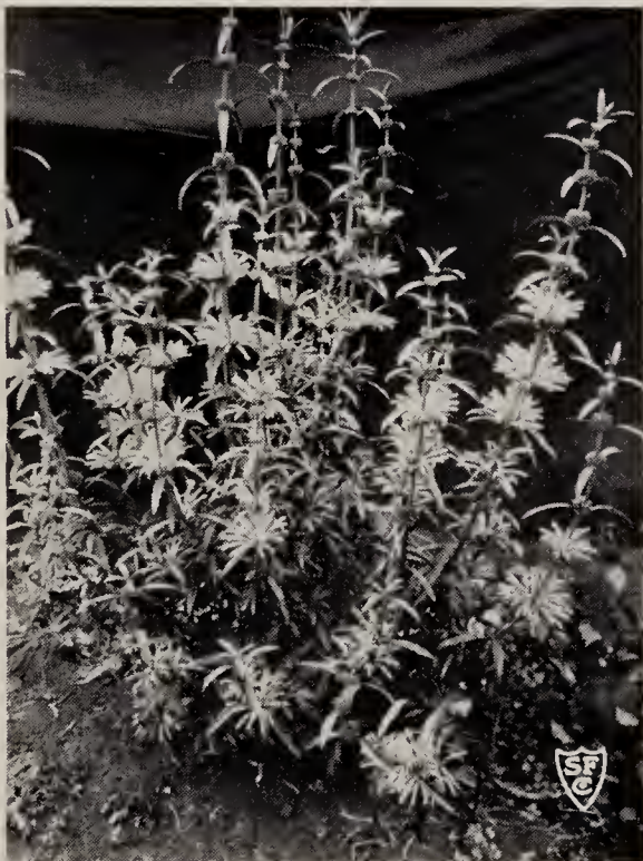
AFRICAN LIONS TAIL. This grows much like a large Salvia but is shrubby with narrow leaves, the long branches bearing whorls of deep orange yellow fuzzy flowers in late September-October of unusual beauty. They make original cut flowers and the plants may be taken up over winter and stored frost free in a basement as they become more pleasing year after year. Need sunny warm locations. 50c each. Extra large $1.00 and $1.50. Large ones grow to 4 ft. tall.